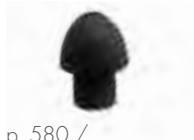
p. 580 / PSF1010-4