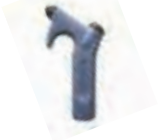
p. 580 / PSF