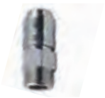
p. 429 / 8310FM