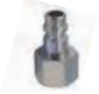
p. 431 / 8370FM