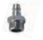
p. 430 / 8360MM