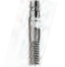
p. 431 / 8395MO