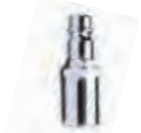
p. 431 / 8340PO