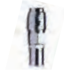
p. 430 / 8390PO