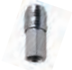
p. 429 / 8320FF